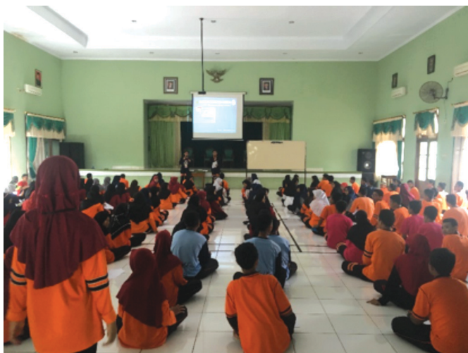
MAN 2 Kudus Kudus, Central Java