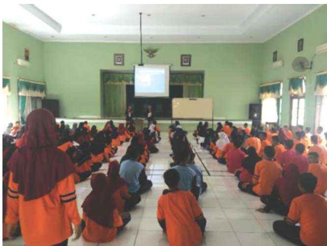
MAN 2 Kudus Kudus, Central Java