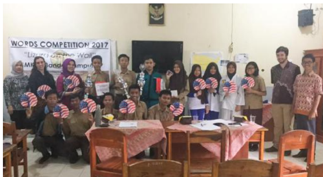
SMKN2 Bandar Lampung Bandar Lampung, South Sumatra

On February 25th, 2017 SMKN2 Bandar Lampung had its WORDS competition. The WORDS competition is an opportunity for students to show off their English speaking skills and personal talents by preparing a 5-minute long performance. The theme of this year's competition was "Cicak on the Wall" where students had to