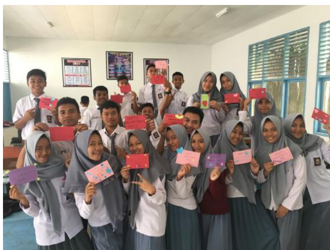
SMAN 7 Kendri Kendari, Southeast Sulawesi

this Valentine's Day celebration extra special for their students. Each student designed a postcard