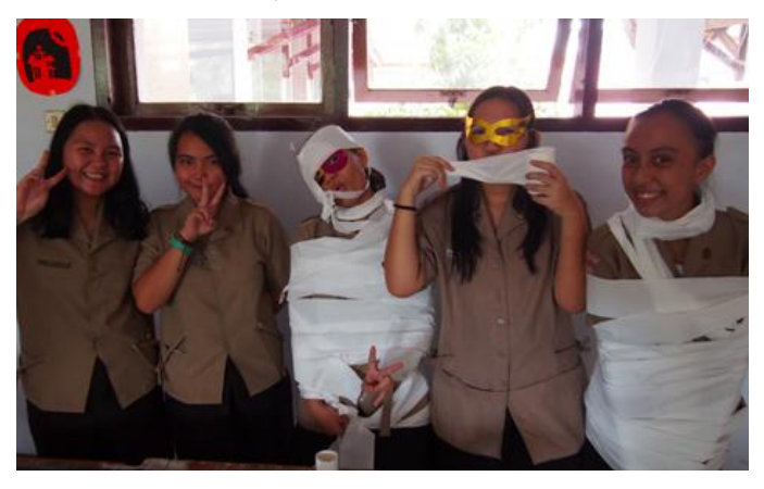
Manado, North Sulawesi October 31, 2015