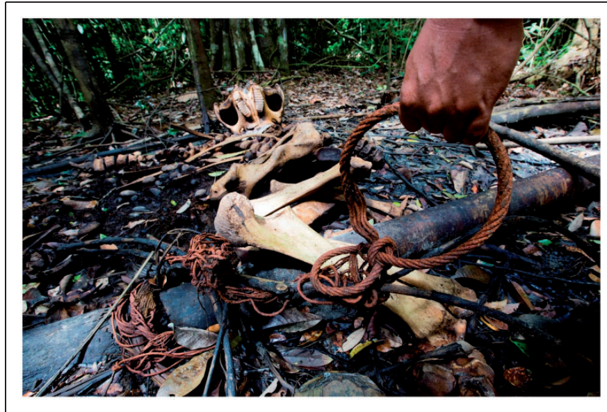
Figure 2. Skeleton of an endangered Sumatran elephant caught in a cable snare trap in the southern Leuser Ecosystem.

to escape, sometimes by self-mutilation (i.e., chewing through an ensnared limb to free itself) (Noss, 1998). These crippled individuals face considerable hardships if they survive (Figure 3).